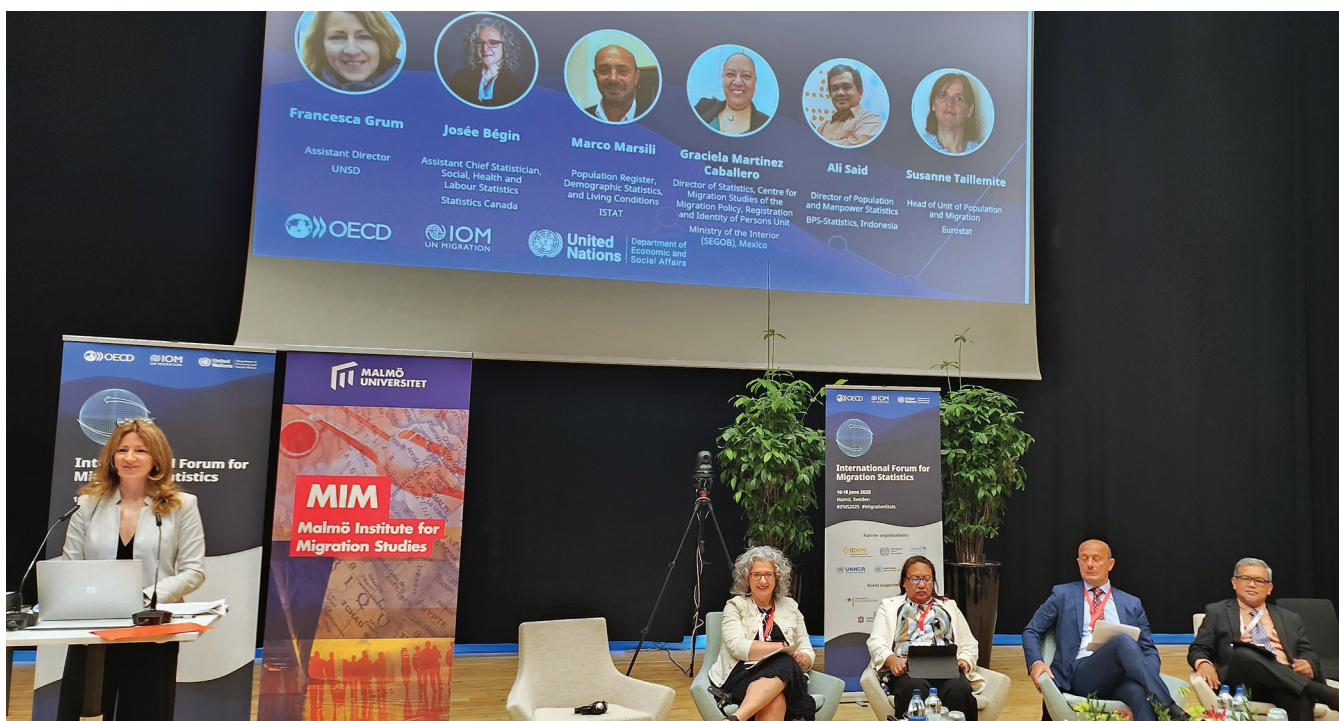
Speakers at the Fourth International Forum on Migration Statistics in June 2025 in Malmö, Sweden

policymaking. Co-organized by UN DESA, the International Organization for Migration (IOM) and the Organisation for Economic Co-operation and Development (OECD), and hosted by the University of Malmö, the Forum convened more than 230 speakers from diverse regions and disciplines, showcasing innovative approaches to enhance migration data and strengthen evidence-based policymaking. UN DESA offered practical