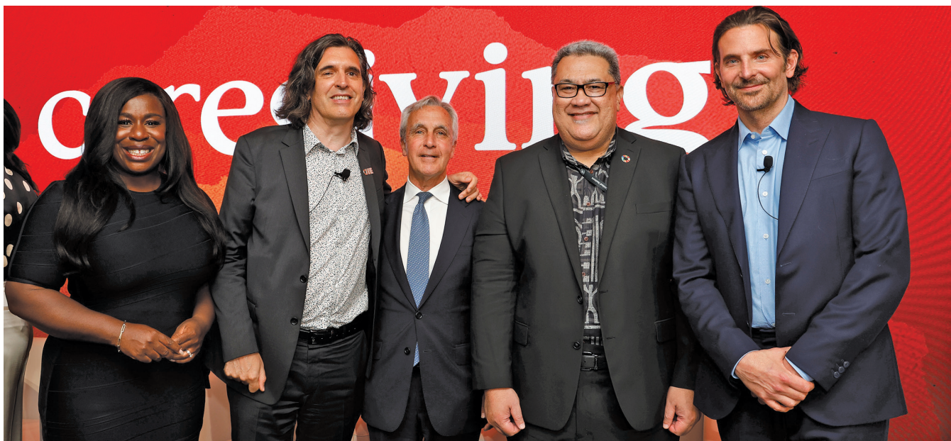
UN DESA co-hosted a flagship screening of the PBS documentary Caregiving, executive produced by Bradley Cooper (right), to spotlight caregiving as a vital social and economic issue.