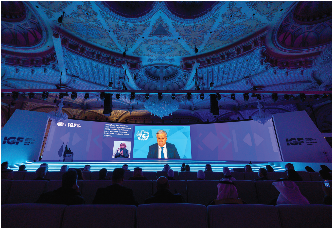
Secretary-General António Guterres addresses the Internet Governance Forum in Riyadh, Kingdom of Saudi Arabia, in 2024.

the Global Digital Compact, adopted at the Summit of the Future in September 2024, and the 20-year review of the UN World Summit on the Information Society (WSIS+20), thereby reinforcing the IGF's role as the primary multi-stakeholder platform for inclusive internet governance. The 2024 Forum culminated in a strong call for global cooperation and governance to ensure that the internet remains open, free, and secure for all.