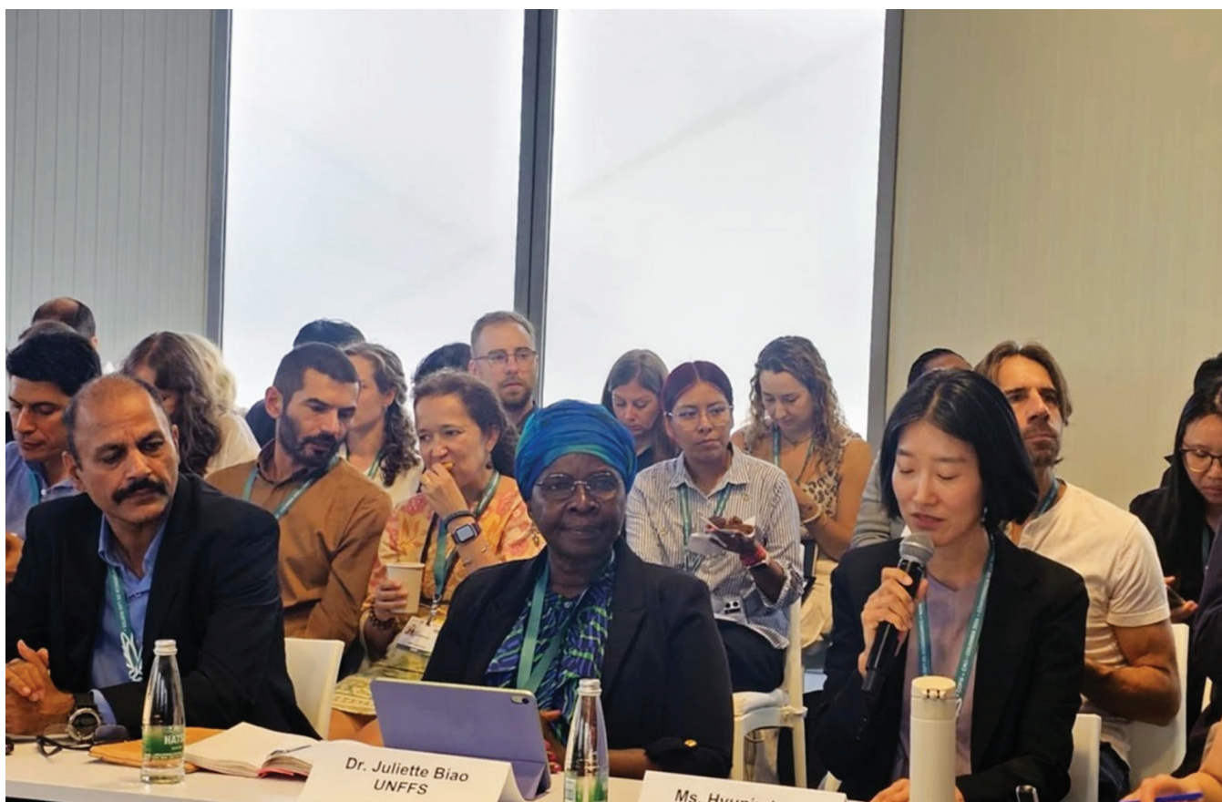
Speakers at a Forest Day event during CBD COP16 present a new joint initiative by the UNFF and CBD secretariats under the Collaborative Partnership on Forests, promoting integrated implementation of the UN Strategic Plan for Forests and the Kunming-Montreal Global Biodiversity Framework.

of the UN Strategic Plan for Forests 2017–2030 and the Kunming-Montreal Global Biodiversity Framework (KM-GBF). Over the past year, the initiative focused on regional analyses in Latin America and Africa, identifying both opportunities and challenges for advancing the GFGs and the KM-GBF in a coherent, synergistic manner. Two publications— Towards a Coherent Forest Agenda and The Forest Factor —were launched during Forest Day at CBD COP16, underscoring the central role of forests in achieving global biodiversity and sustainability targets.