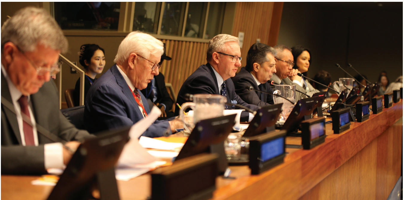
Opening session of the 63rd Session of the Commission for Social Development (CSocD), February 2025, New York

UN DESA supported Member States to advance structural reforms and inclusive policies, reinforcing its commitment to building resilient societies and equitable opportunities for all. At the 63rd session of the Commission for Social Development, held from 10 to 14 February 2025, Member States reaffirmed the importance of addressing the root causes of inequality as a foundation for lasting social transformation. The Commission underscored the need to empower individuals and foster inclusive environments where every voice is heard and valued. The session brought together senior government officials and ministers, UN entities, and over 500 civil society organizations, creating a vibrant platform for dialogue, knowledge-sharing, and collective action. It reaffirmed the global commitment to advancing social inclusion and cohesion as key drivers of sustainable development.