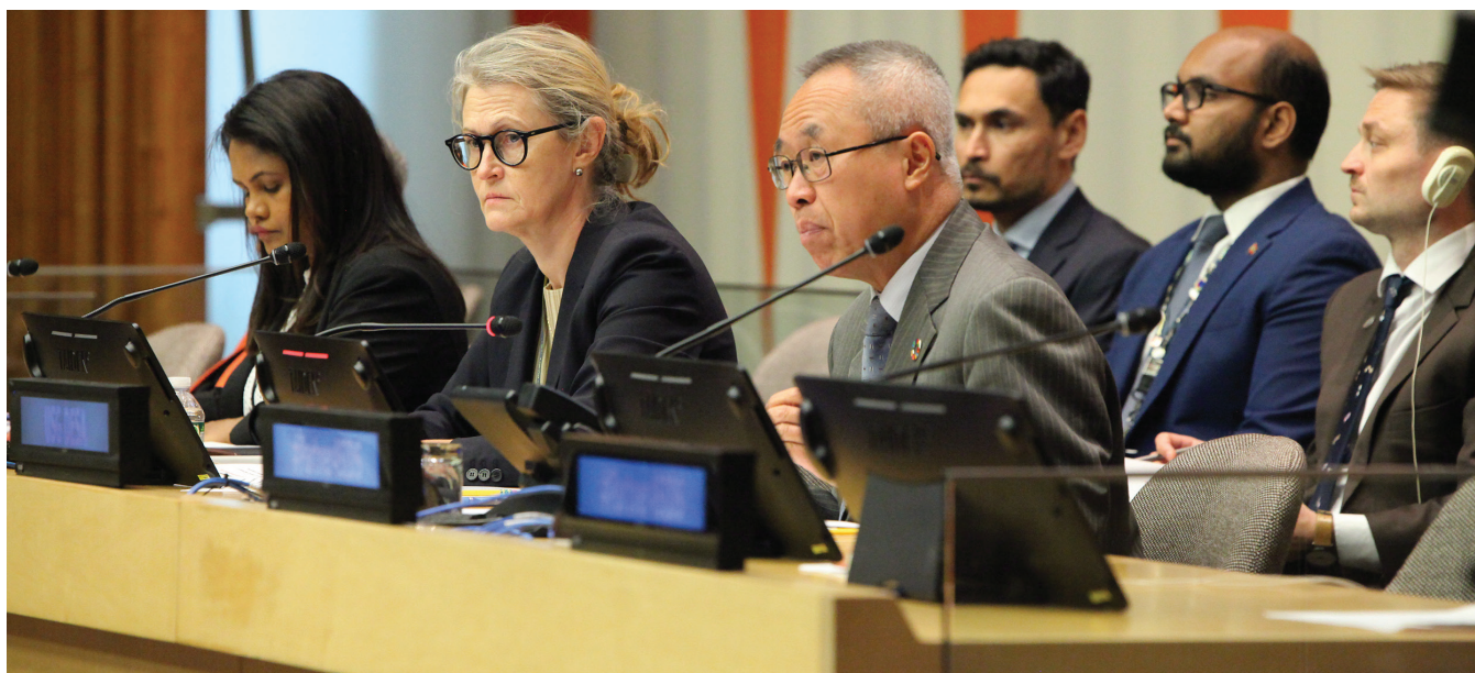
UN Under-Secretary-General Li Junhua participates in the SIDS Civil Society Engagement Forum at UN Headquarters in New York on 5 February 2025.

UN DESA continued to play a essential role in supporting the growing involvement of non-governmental organizations (NGOs) and civil society in UN processes. As the substantive secretariat to ECOSOC's 19-member Committee on NGOs, the Department facilitated Member States' review and approval of applications