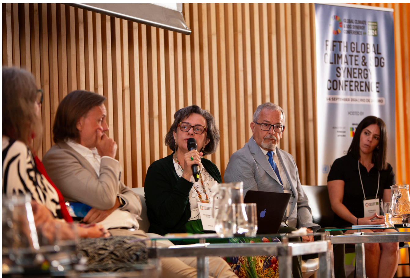
Participants discuss the role of bioeconomy as a key economic paradigm for tackling climate change, promoting sustainable development, and restoring forests during a thematic discussion on regenerating nature at the fifth Global Climate and SDG Synergies Conference in September 2024 in Rio de Janeiro, Brazil.

Climate and SDG Synergies, 5–6 September 2024, in Rio de Janeiro, Brazil. Building on the 2024 Global Report on Climate and SDG Synergies, the conference showcased evidence-based and forward-looking solutions to bridge climate and development goals, setting the stage for COP29 and the Summit of the Future. The fifth conference brought together high-level representatives from more than 30 countries, with strong participation from youth, civil society, and UN leadership. At COP29 in Baku, Azerbaijan, the Department also organized the SDG Pavilion in collaboration with UNFCCC and DGC, engaging more than 120 partners across more than 100 events to spotlight integrated solutions and transformative partnerships that drive both climate and sustainable development progress.