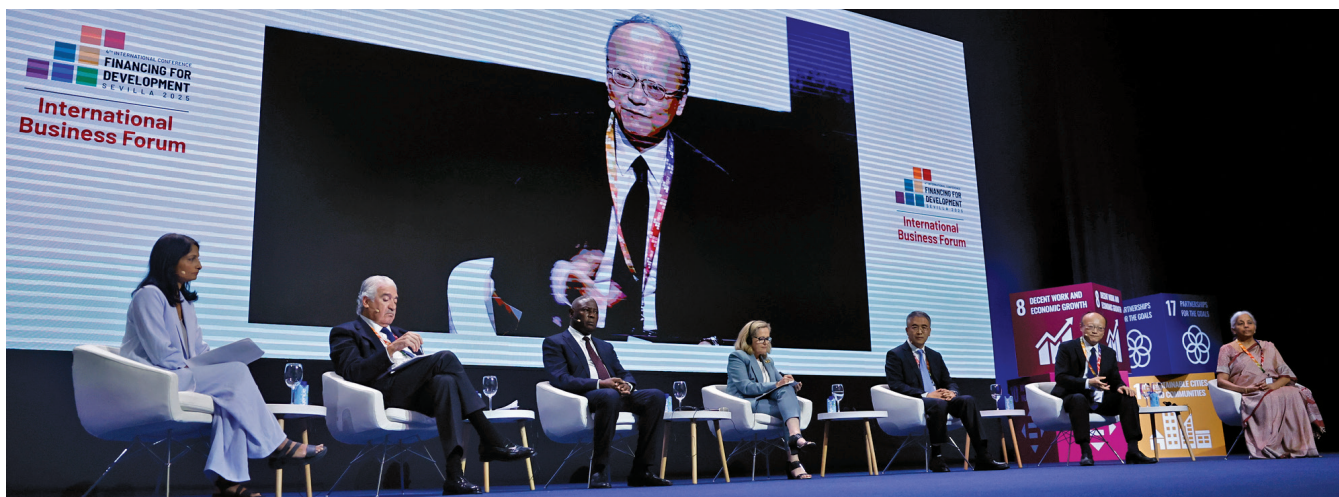
Panelists at the FFD4 International Business Forum