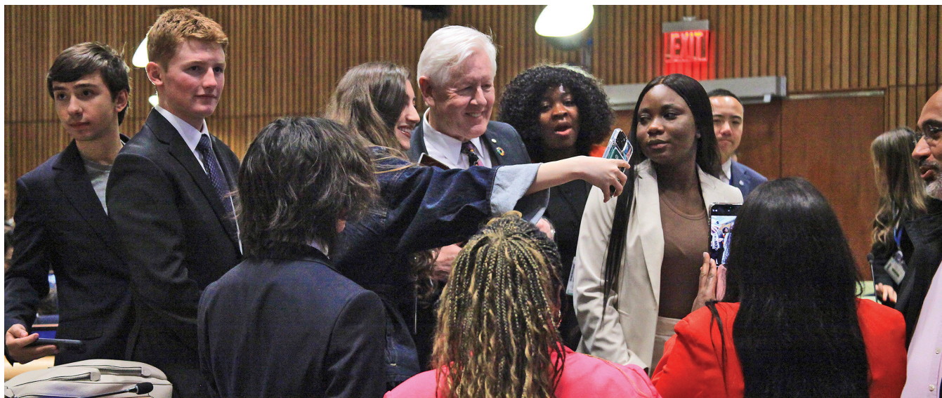
Youth delegates interact with the President of ECOSOC at its 2025 session, H.E. Mr. Bob Rae (Canada), at the 2025 ECOSOC Youth Forum in April 2025 in New York.

The Forum convened government officials and business leaders for a focused dialogue on how more innovative policies and stronger partnerships can fast-track progress toward the SDGs as the 2030 deadline approaches. Discussions explored the enabling policy environments and institutional capacities needed to scale up sustainable private sector action, particularly in support of the Pact for the Future.