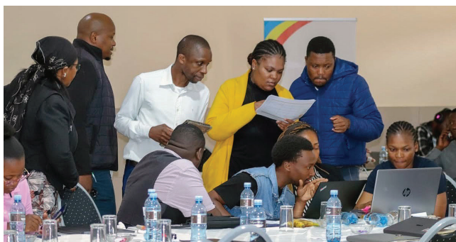
Local government and youth representatives participate in a VLR exercise on 16 October 2024 in Eswatini.

and stakeholder representatives with the tools and knowledge to align local development planning with the SDGs. These efforts helped bridge coordination gaps and fostered cross-sectoral collaboration, engaging institutions responsible for planning, statistics, urban development, housing, and gender equality. As a direct outcome, Eswatini used the insights gained from its first VLRs to inform its VNR, which was presented at the 2025 HLPF. Seven municipalities have participated in their first VLRs, marking a first-of-its-kind synchronized review process in the country. This innovative, multilevel effort contributed to a more cohesive and inclusive approach to SDG implementation, reinforcing both horizontal and vertical coordination and setting a model for transformative, whole-of-government engagement.