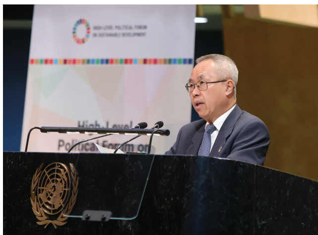
Under-Secretary-General Li Junhua speaks at the opening of the High-level Political Forum on Sustainable Development, July 2025, New York.

On the margins of the 2025 HLPF, in addition to 187 side events, UN DESA also curated a series of 12 high-profile Special Events in collaboration with key partners. These events featured the launch of flagship reports and dynamic thematic discussions, fostering broad