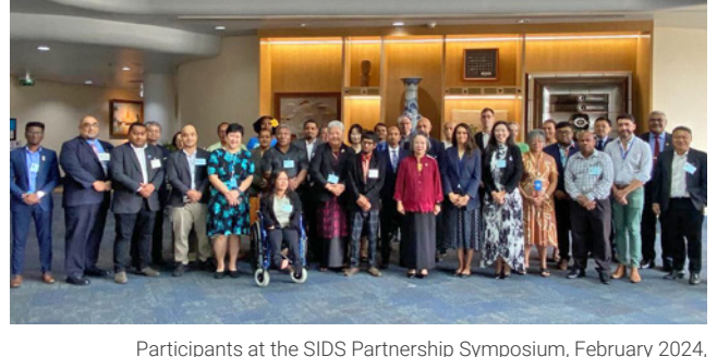
Participants at the SIDS Partnership Symposium, February 2024, Bangkok, Thailand.

strengthened partnerships and local approaches. A comprehensive national partnership landscape assessment for Moldova was conducted, analysing challenges and opportunities to accelerate SDG implementation through multi-stakeholder partnerships. The Department also collaborated with Partnerships2030 and the Global Forum on National SDG Advisory Bodies to raise awareness and develop enabling factors for multi-stakeholder partnerships through the SDG Partnership Symposium and the launch of the Unite to Ignite report.