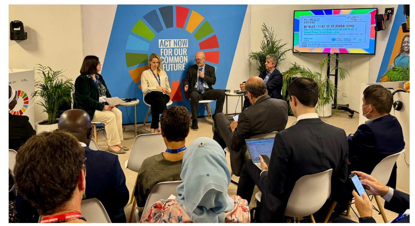
Speakers discuss primary forests at the "Climate & Canopy: Amplifying Action for SDG 13 & 15 through Primary Forest Conservation" event at the SDG Pavilion.