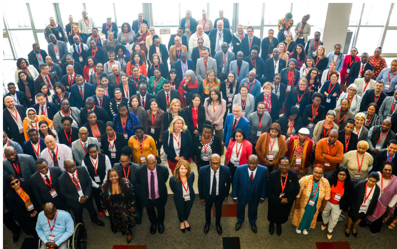
9th Global Forum on Gender Statistics, Johannesburg, South Africa. | STATISTICS SOUTH AFRICA

UN DESA assisted several countries to identify and address gender gaps in public administration. Capacity-development modules were developed in partnership with Bhutan, Lao People's Democratic Republic, Mauritius, and Senegal, which were based on national and international reviews of practice to promote women leadership in public administration. Capacity development workshops were conducted in October and November 2023, laying the groundwork for national action plans to promote women's advancement in public sector leadership. Draft action plans were developed with UN DESA's support and validated nationally. Peer review workshops were held in Thailand and Mauritius in April and June 2024, involving countries from Africa and Asia-Pacific, including SIDS. These sessions promoted a community of practice to enhance gender-responsive strategies. In June 2024, a global workshop in the Republic of Korea further shared insights and lessons from these gender equality action plans.