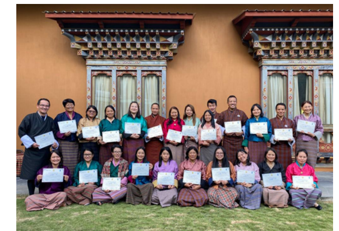
Workshop on “Promoting the presence and leadership of women within public institutions at the national and local levels” in October 2023 in Bhutan.

“ [The workshop] made me realize how I can contribute to small actions in my department to cater towards improving gender equality which will finally lead to achieving gender equality in public administration. Participant of the “Promoting the presence and leadership of women within public institutions at the national and local levels” workshop Bhutan in October 2023 ”