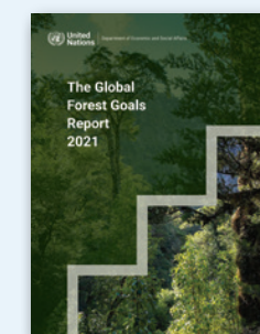
The Global Forest Goals Report