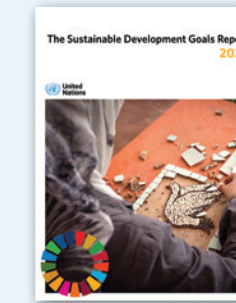
The Sustainable Development Goals Report