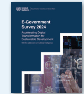
United Nations E-Government Survey