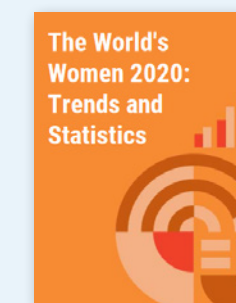
The World's Women