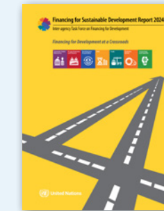
Financing for Sustainable Development Report