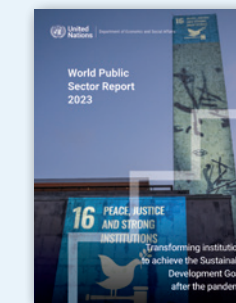
World Public Sector Report