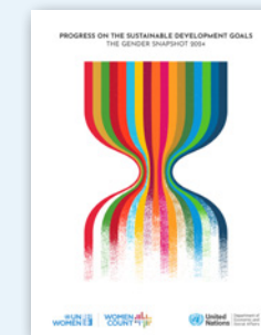
The Gender Snapshot