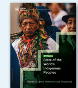
State of the World's Indigenous Peoples