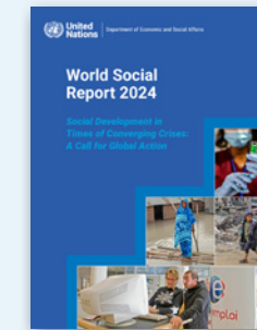
World Social Report