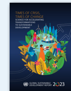
Global Sustainable Development Report