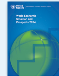
World Economic Situation and Prospects