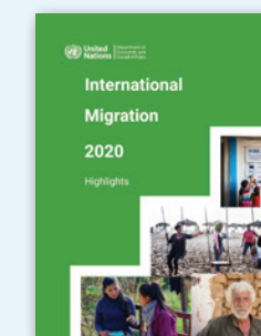
International Migration Report