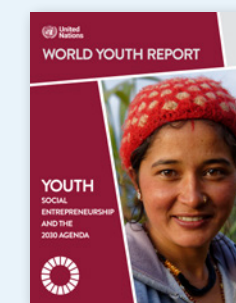
World Youth Report