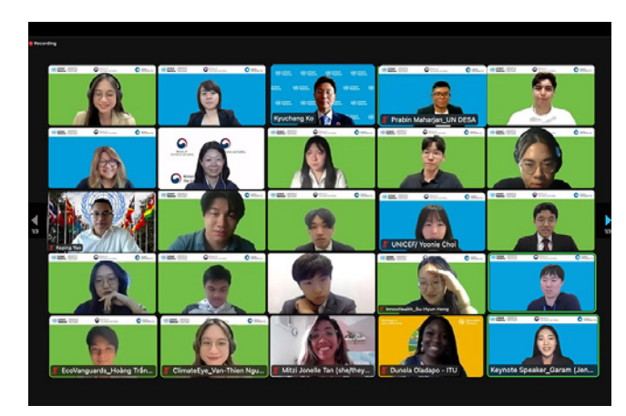
Screenshot from 7th Youth Forum on SDG Implementation.

collaboration with the Ministry of the Interior and Safety (MOIS) and Incheon Metropolitan City of the Republic of Korea, the Youth Forum was held online under the theme, "Enabling Youth as Agents of Change for Digital Transformation and Inclusive Climate Action". Over