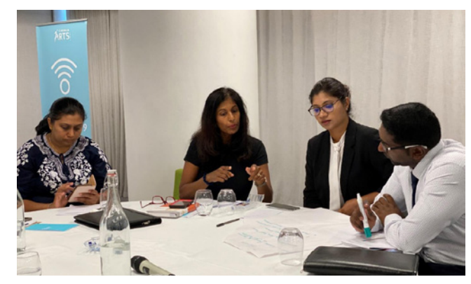
Capacity building workshop in Mauritius.

UN DESA supported several Small Island Developing States to plan and implement national sustainable development strategies and build resilience in response to crises, developing longer-term approaches to sustainable development and mobilizing climate finance. The project empowered government officials and national stakeholders in Mauritius, Seychelles, Guinea-Bissau, and Jamaica to conduct integrated policy and strategy assessments, including the valuation of ecosystem services for national planning and pandemic recovery. It aims to improve evidence-based decision-making by presenting scenarios and pathways for sustainable development.