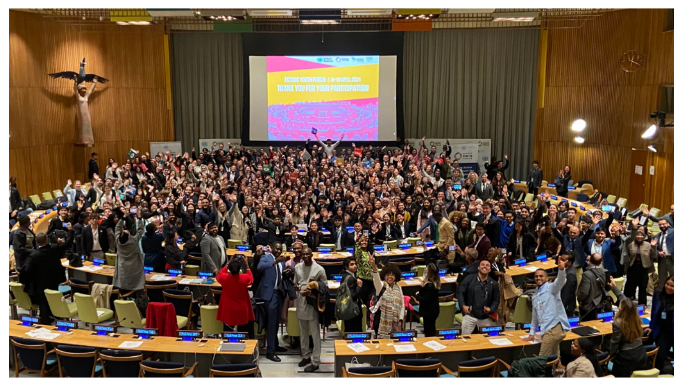
Participants of the ECOSOC Youth Forum 2024.

200 participants from all over the world discussed the role of young people in the age of digital transformation and as key players for climate action. The Forum also continued to run its annual speech contest, through the Ideas for Change Contest, which invited young people to develop innovative solutions.