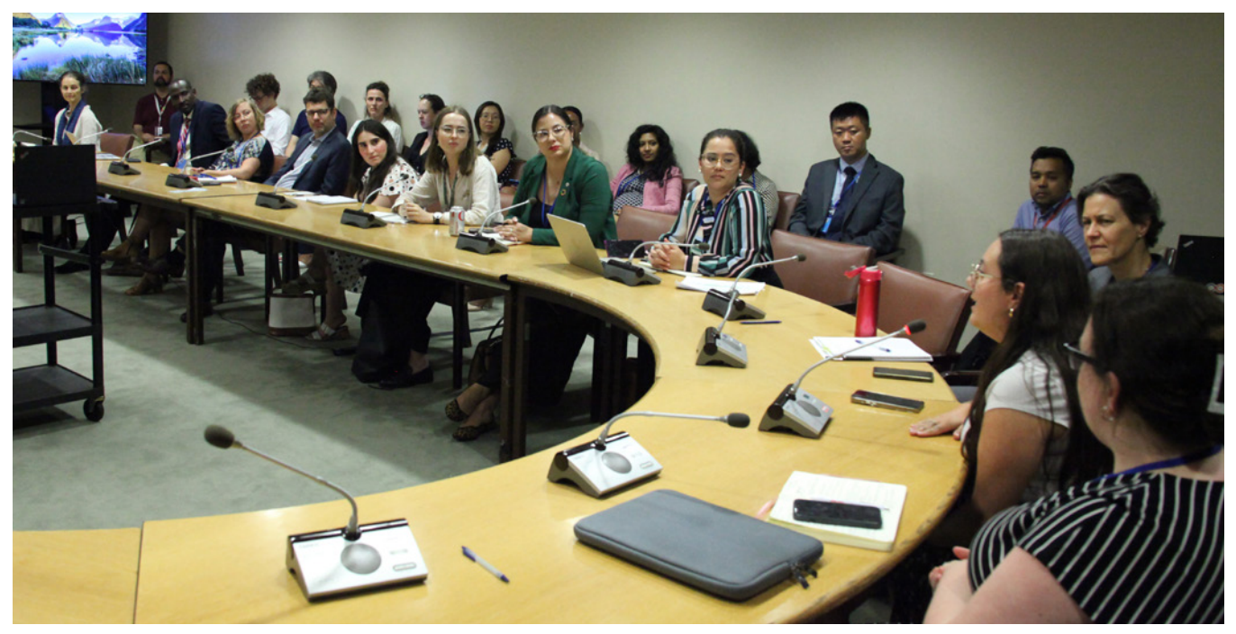
Participants at the World Social Report 2024 side event at HLPF 2024.

In Mauritius, UN DESA also developed capacities for integrated strategic planning and institutional arrangements for policy coherence. The initiative has enhanced knowledge among participants to apply systems thinking in SDG implementation. The Government of Mauritius has requested further support to build capacities in systems thinking for policy coherence and strategic foresight through "Maurice Strategie" – a new entity fostering evidence-based dialogue between the private sector, public sector, and civil society organizations.