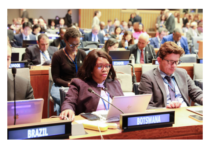
Delegates participate in the 19th session of the United Nations Forum on Forests in New York.

Building on the launch of the 2023 quadrennial Global Sustainable Development Report (GSDR) written by the Independent Group of Scientists appointed by the Secretary-General, UN DESA brought together a wide range