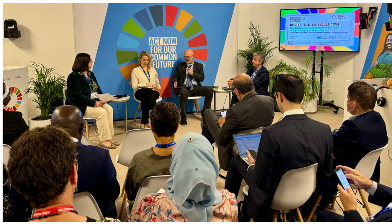
Speakers discuss primary forests at the "Climate & Canopy: Amplifying Action for SDG 13 & 15 through Primary Forest Conservation" event at the SDG Pavilion.