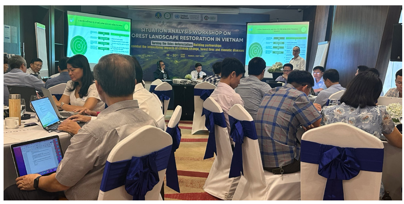
Participants hear a presentation at the Capacity-building Workshop on Forest Landscape Restoration in Viet Nam.

To foster synergies with global efforts, UN DESA and the Food and Agriculture Organization of the United Nations (FAO) are jointly developing open access e-learning courses on Integrated Forest Landscape Restoration. UN DESA has also been supporting a regional initiative for the establishment of a decade of afforestation and reforestation and an International Conference on Afforestation and Restoration, held in July 2024 in the Republic of Congo.