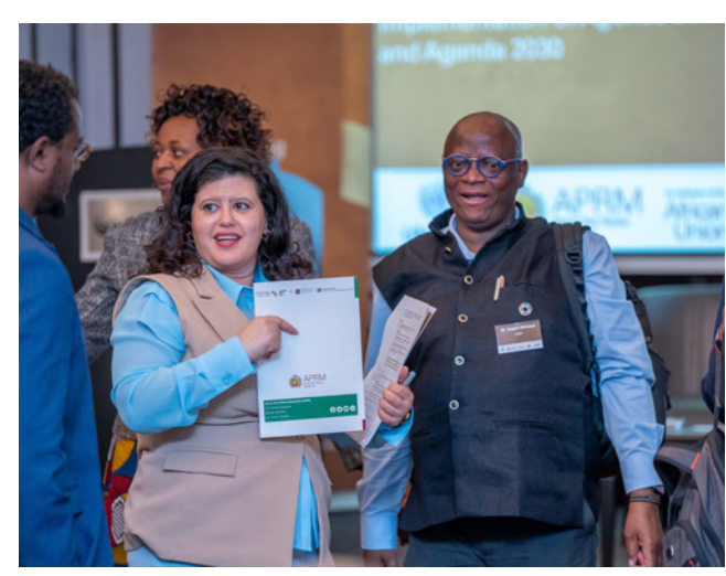
UN DESA and APRM Workshop, 26–28 October 2023, Cape Town, South Africa.