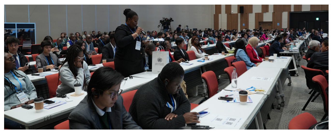
The 7th Regional Symposium on Effective Governance and Digital Transformation for Accelerating Progress towards the 2030 Agenda, hosted by Republic of Korea on 17–19 October 2023.

UN DESA provided expert support to Supreme Audit Institutions (SAIs), given their role in the follow-up and review of the SDGs. For example, the Department collaborated with the Federal Court of Accounts of