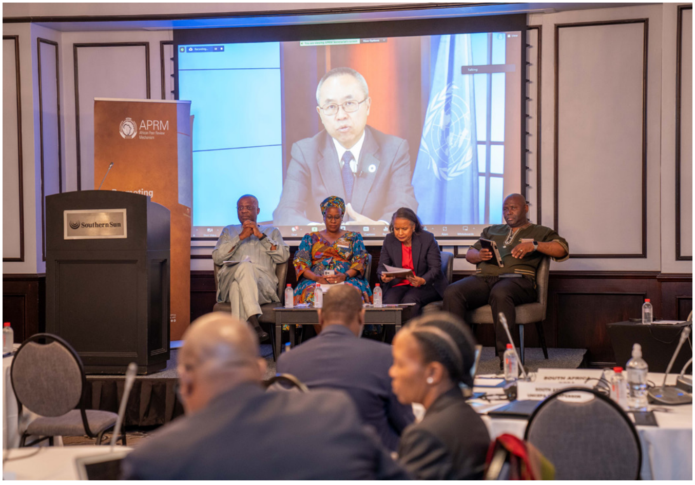
Li Junhua, Under-Secretary-General for Economic and Social Affairs, at the opening of the continental workshop on Strengthening Institutional Capacities in Africa for Effective Implementation of the 2030 Agenda and Agenda 2063: Follow-up to the 2023 Summit in South Africa in October 2023.