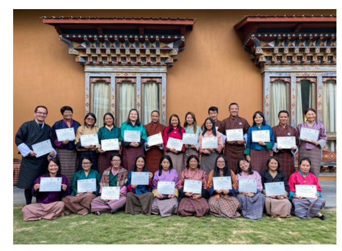
Workshop on "Promoting the presence and leadership of women within public institutions at the national and local levels" in October 2023 in Bhutan.

Participant of the "Promoting the presence and leadership of women within public institutions at the national and local levels" workshop Bhutan in October 2023