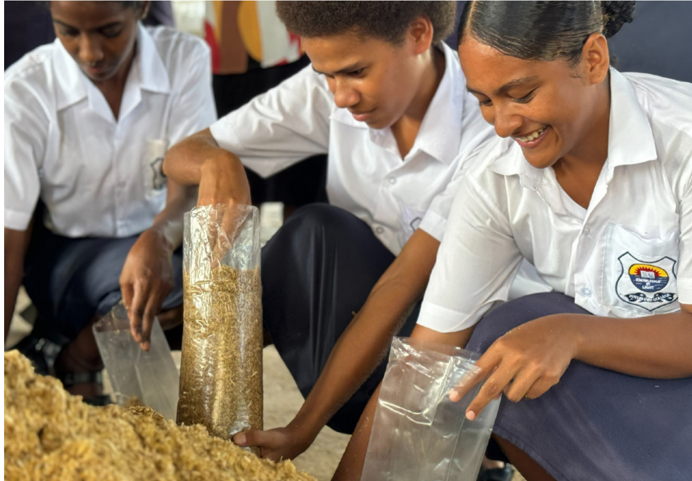
Participants at the international workshop in Fiji cultivating mushrooms using Juncao technology.

the triennial review of the list of LDCs, which highlighted the mixed progress made amidst challenging global conditions, as this group of deeply deprived countries strive to graduate from the LDC classification.