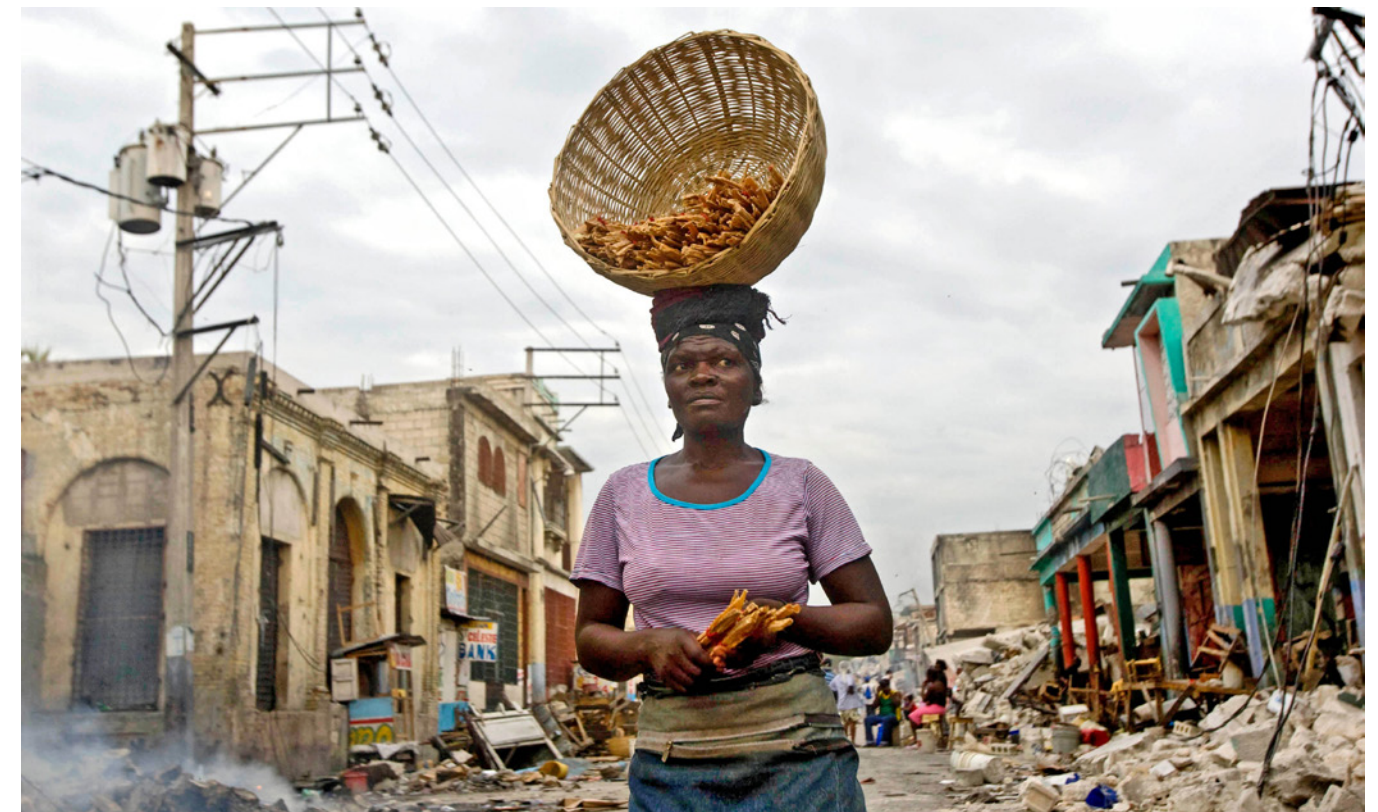
A woman walks by a fire in the rubble-filled streets of Port-au-Prince, Haiti.

UN DESA's commitment to addressing complex crises and supporting the people whose lives and livelihoods they threaten is evident in its support to the ECOSOC Ad Hoc Advisory Group on Haiti (AHAGH). This group has been actively monitoring the situation, engaging stakeholders, and advocating for a holistic approach to address the multifaceted crisis in Haiti. In June 2024, the Department supported the AHAGH meeting in its efforts to address the latest developments concerning the implementation of the UN Cooperation Framework for Sustainable Development for Haiti (2023–2027). The meeting underscored the urgency to deploy the Multinational Security Support Mission to assist the Haitian National Police in securing the country and boosting economic activity, as well as a need for funding for disarmament, demobilization, and reintegration efforts. UN DESA will continue to contribute to efforts to stabilize Haiti and promote sustainable development in the country.