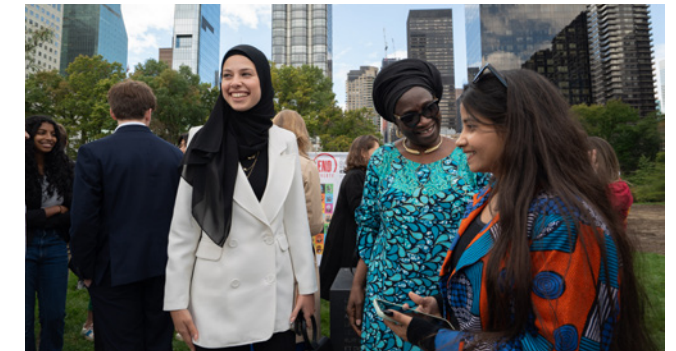
Participants at the Commemoration of the International Day for the Eradication of Poverty, celebrated on 17 October 2023.