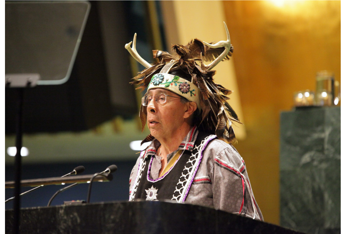
A speaker at the United Nations Permanent Forum on Indigenous Issues in April 2024.

UN DESA is empowering communities to address poverty, environmental degradation, and food security challenges through innovation. In Fiji, UN DESA collaborated with national partners to showcase the transformative