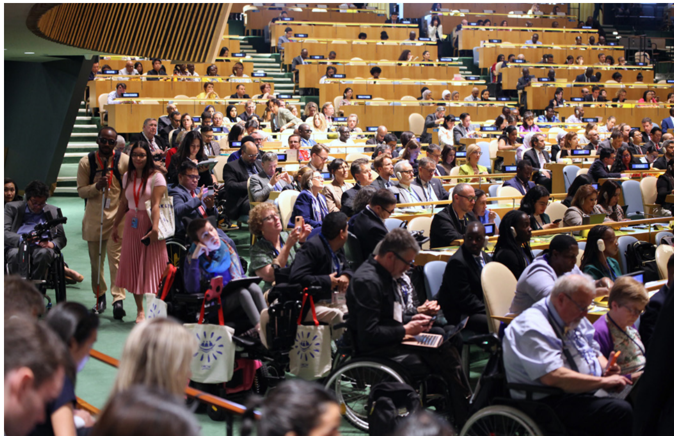
Delegates at COSP17.

a pivotal role in ensuring meaningful participation of disability experts from traditionally marginalized groups in the 17th Conference of States Parties to the Convention of the Rights of Persons with Disabilities (COSP17). By consulting with representatives from organizations of Indigenous women with disabilities, deaf persons, and those with deaf blindness on key decisions, UN DESA fostered an inclusive and diverse Conference. This led to record social media engagement, raising awareness and fostering dialogue on disability rights. The Department's major UN Disability and Development Report 2024 , produced through collaboration with more than 200 experts including representative organizations of persons with disabilities, also provides a robust and up-to-date analytical basis for disability-inclusive implementation of the SDGs globally.