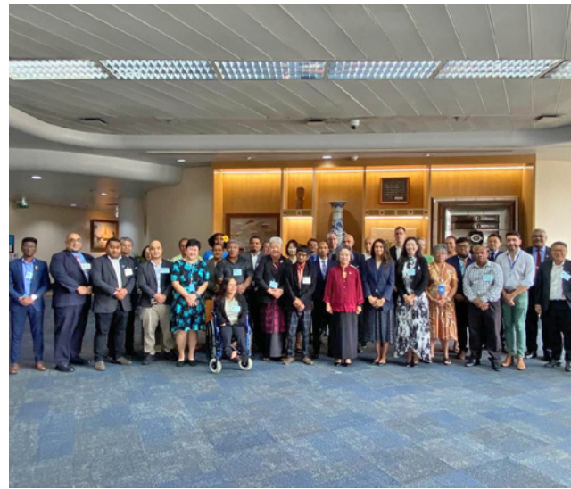
Participants at the SIDS Partnership Symposium, February 2024, Bangkok, Thailand.

The 2030 Agenda Partnership Accelerator Initiative led by the Department continued to support effective multi-stakeholder partnerships for the SDGs – offering training and advisory services for stronger collaboration across sectors to Member States, UN entities, and stakeholders. Through the Partnership Accelerator, UN DESA established the Mexico Network of Partnerships for Local Action, collectively developed by various stakeholders dedicated to realizing the SDGs through strengthened partnerships and local approaches. A comprehensive national partnership landscape assessment for Moldova was conducted, analysing challenges and opportunities to accelerate SDG implementation through multi-stakeholder partnerships. The Department also collaborated with Partnerships2030 and the Global Forum on National SDG Advisory Bodies to raise awareness and develop enabling factors for multi-stakeholder partnerships through the SDG Partnership Symposium and the launch of the Unite to Ignite report.