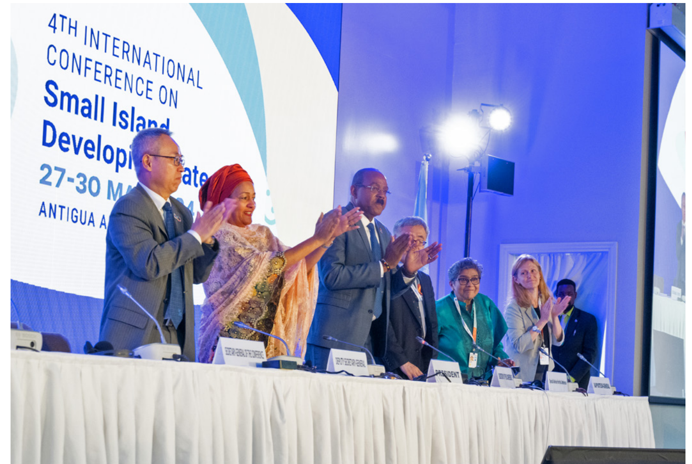
UN DESA Under-Secretary-General Li Junhua, Deputy Secretary-General Amina Mohammed, Prime Minister Gaston Browne of Antigua and Barbuda, and High Representative for the LDCs, LLDCs and SIDS Rabab Fatima at the closing session of SIDS4 in Antigua and Barbuda in May 2024.

Building on collaborative relationships with major private sector umbrella organizations, UN DESA carved out spaces alongside important intergovernmental gatherings to shine a spotlight on the impact of the business sector on SDG implementation. The