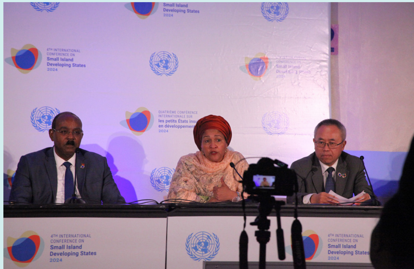
Amina Mohammed, Deputy Secretary-General, with Li Junhua, Under-Secretary-General for Economic and Social Affairs and Secretary-General of the SIDS4 Conference, and Gaston Browne, Prime Minister of Antigua and Barbuda, host of SIDS4.

UN DESA highlighted the promising yet vulnerable economic prospects of SIDS in the 2024 World Economic Situation and Prospects report. In 2023, SIDS experienced a robust rebound in tourism, crucial for their