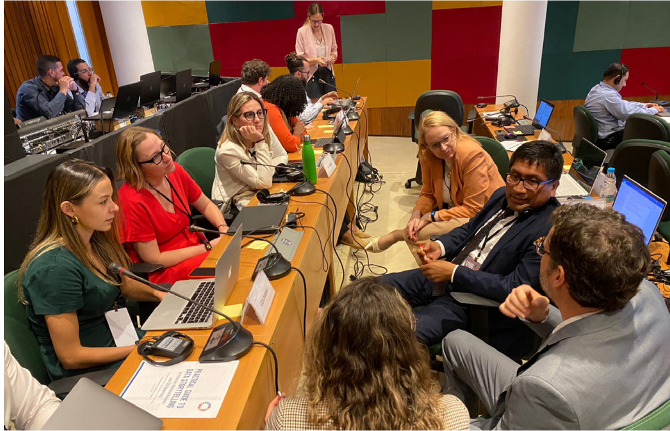
Participants at the Second Global Workshop for the 2024 Voluntary National Reviews in Rio de Janeiro, Brazil, April 2024.

other subjects. UN DESA followed up these workshops with a virtual “knowledge exchange” webinar of VNR-presenting countries with UN entities, academic institutions, and other organizations assisting with the VNR process.