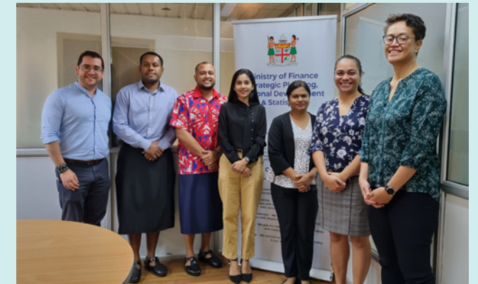
UN DESA colleagues work with Government counterparts in Fiji on an integrated national financing framework.

UN DESA worked with SIDS to prioritize sustainable financing strategies. Through projects like “Financing for SIDS (FINS)”, spanning Fiji, the Dominican Republic and Seychelles, the focus is on integrating national financing frameworks to bolster planning and coordination. Technical guidance from UN DESA aided SIDS in crafting strategic investment projects aligned with