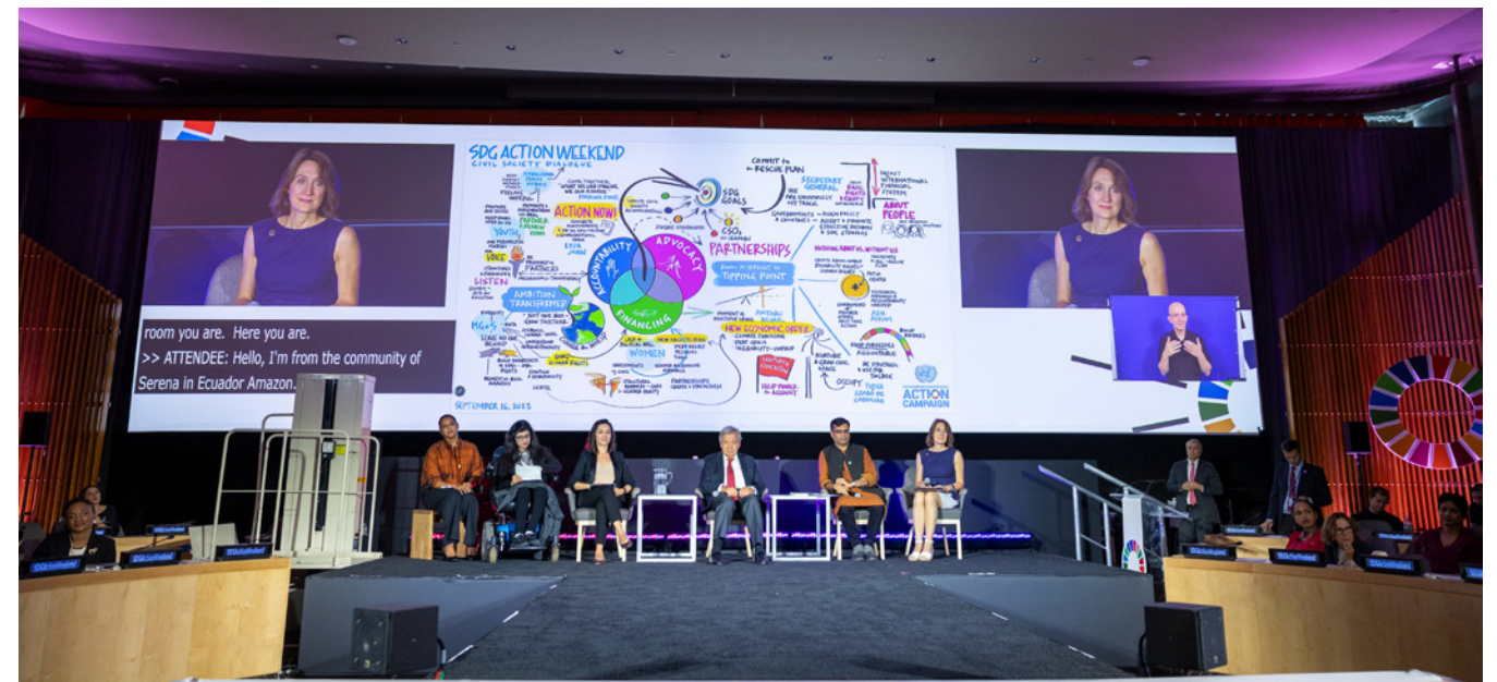
Secretary-General António Guterres (centre right) participates in the SDG Action Weekend Civil Society Dialogue at UN Headquarters in New York, in September 2023.

UN DESA facilitated the exchange of experiences and knowledge among government officials from more than 30 countries engaged in preparing VNRs for the 2024 HLPF through three Global Workshops for the 2024 VNRs in Addis Ababa, Ethiopia, in December 2023, Rio de Janeiro, Brazil, in April 2024 and New York in July 2024. The workshops also explored specific issues and challenges related to the VNR preparations, featuring sessions on institutions, stakeholder engagement, data and statistics, and means of implementation, among