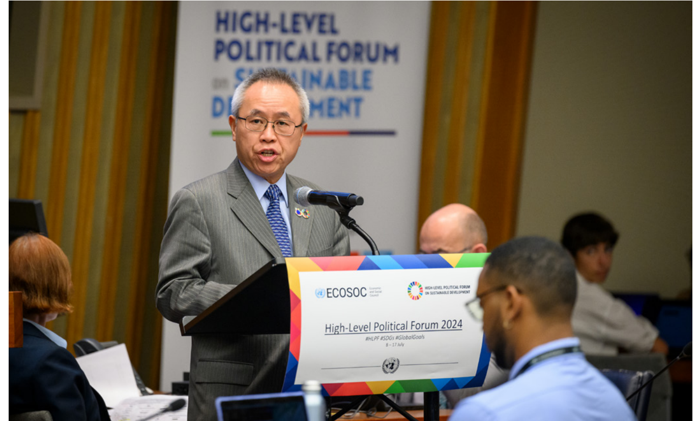
Under-Secretary-General Li Junhua, addresses a session on Small Island Developing States during the High-level Political Forum 2024.