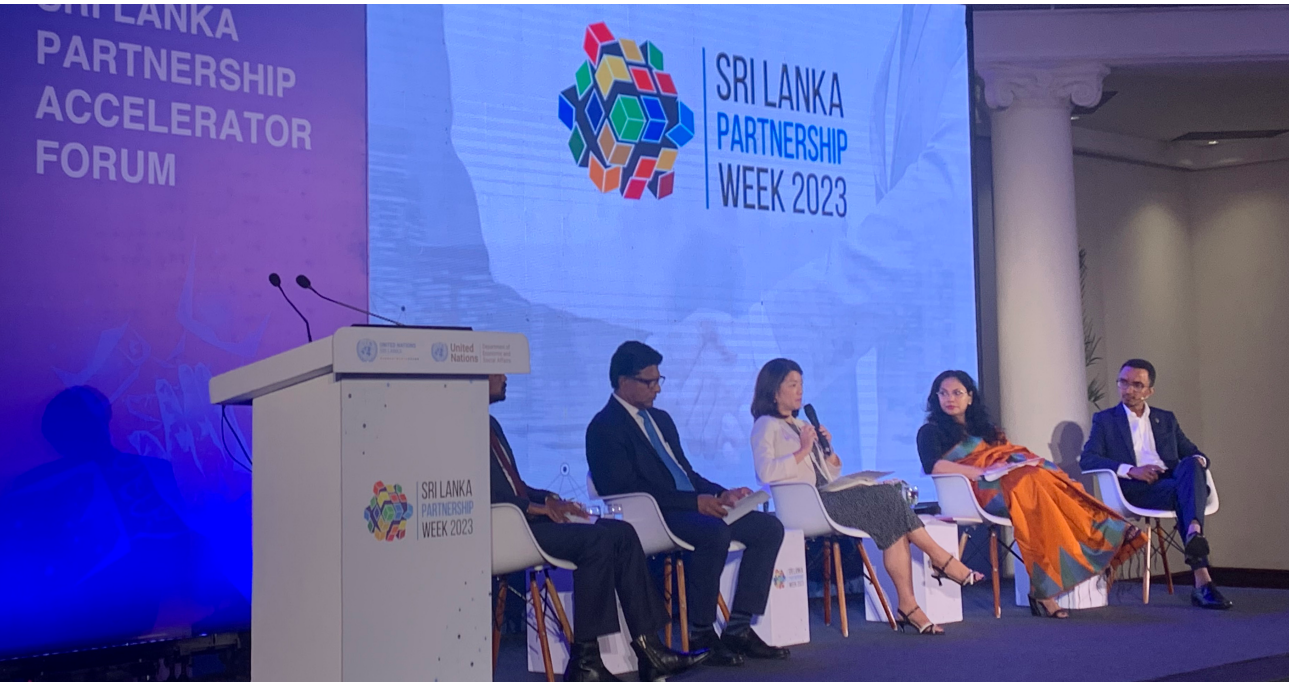
Collaboration and Innovation took center stage at the Sri Lanka Partnership Week 2023