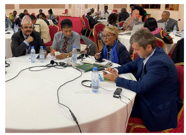
Participants discuss at the International Mayors Forum in April 2023 in Dakar, Senegal

In collaboration with the Asia-Europe Foundation, UN DESA also convened the 2022 Sustainable Development Transformation Forum (SDTF) to