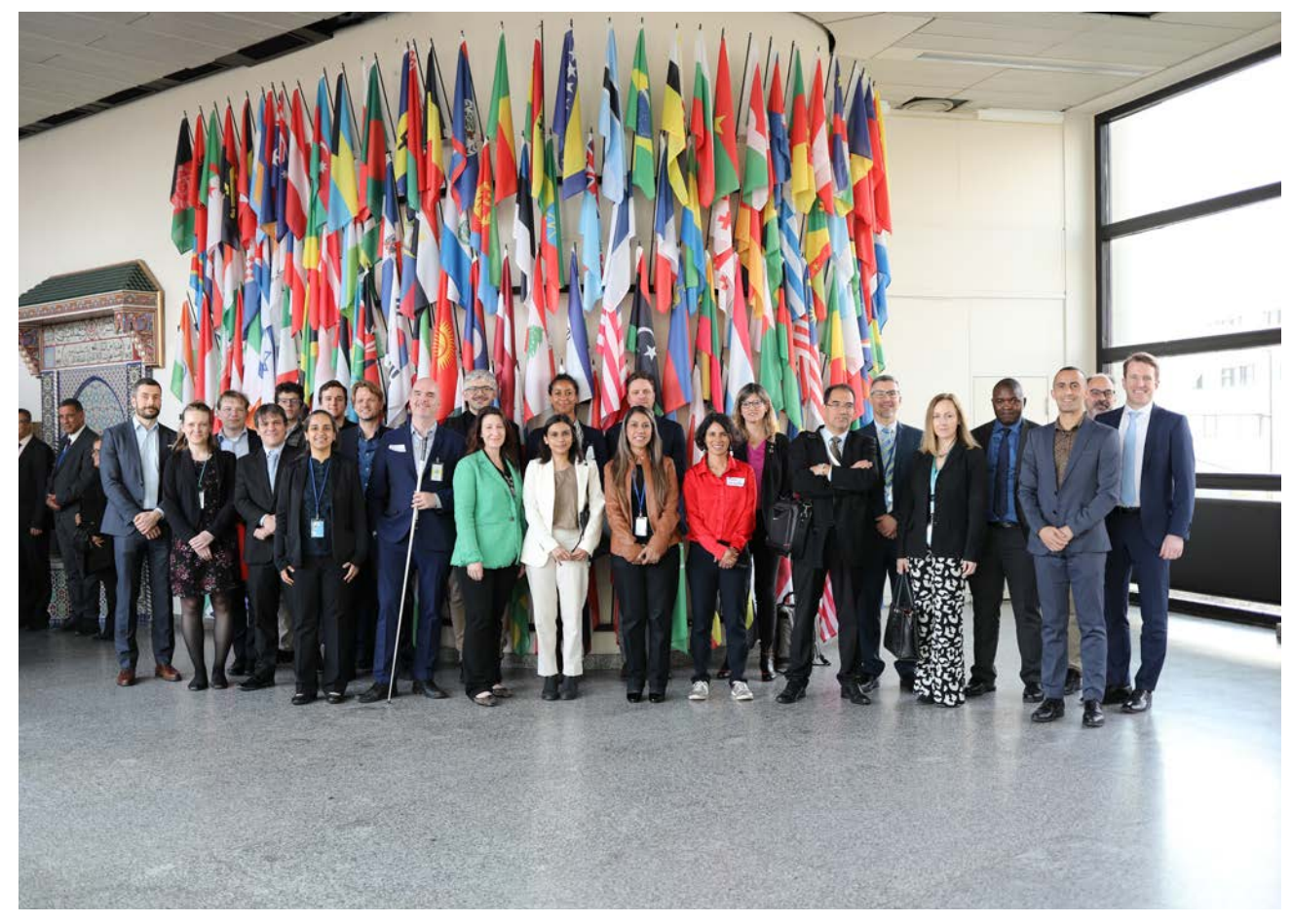
Participants at the Expert Group Meeting (EGM) on SDG 9 (Industry, Innovation and Infrastructure) and its interlinkages with other SDGs, held in March 2023, in Vienna, Austria

To help prepare the stage for Member States in presenting the Voluntary National Reviews (VNRs) at the HLPF in July 2023, UN DESA organized two global preparatory workshops in December 2022 in Turin, Italy, and in March 2023 in Sofia, Bulgaria. These workshops provided opportunities for