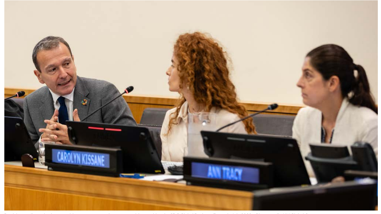
Participants discussing just transition to net zero and a nature positive world at the SDG Global Business Forum in July 2023 - Photo credit: UN Global Compact

As part of the Global Initiative on Building Capacities of Public Servants for the implementation of the SDGs, UN DESA's Presidential Summit of national schools and institutes of public administration resulted in commitments from around the world to mainstream the SDGs in their curricula. The