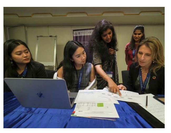
UN DESA staff and participants discuss at the GSDR 2023 Regional Consultation Workshop for East Asia and the Pacific in November 2022 in Manila, Philippines

The Department, in partnership with various UN and other entities, also organized 16 VNR Labs during the HLPF in July 2023. The VNR Labs served as an informal platform for experience-sharing and reflection on the VNR process, covering a range of topics related to SDG implementation.