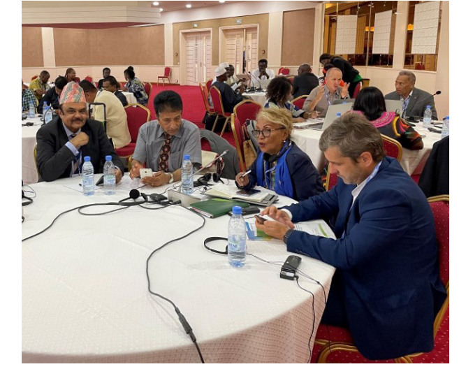
Participants discuss at the International Mayors Forum in April 2023 in Dakar, Senegal

interconnected importance and breadth of SDG11 to the whole 2030 Agenda, as well as how local and regional governments are localizing the SDGs through high-impact localization policies.