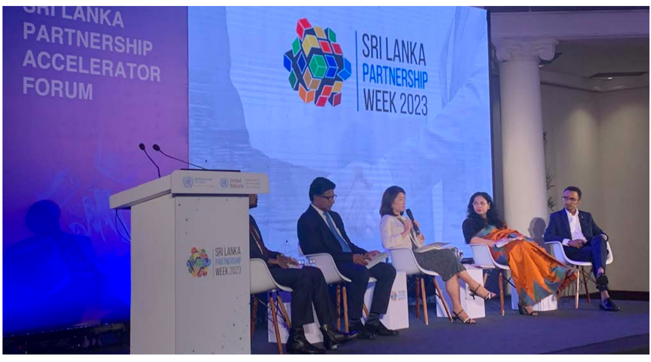
Collaboration and Innovation took center stage at the Sri Lanka Partnership Week 2023

Throughout the year, UN DESA continued to support the implementation of the SAMOA Pathway to advance sustainable development in Small Island Developing States that face unique social, economic and environmental vulnerabilities. UN DESA supported the work of the High-Level Panel of the Multidimensional Vulnerability Index (MVI) as well as the SIDS Partnership Framework. Ahead of the Fourth International Conference on Small Island Developing States in 2024, in July and August 2023, the Department supported the regional preparatory meetings for the Atlantic, Indian Ocean and South China Seas (AIS) region in Mauritius, for the Caribbean region in Saint Vincent and the Grenadines, for the Pacific Region in Tonga, and the inter-regional preparatory meeting in Cabo Verde.