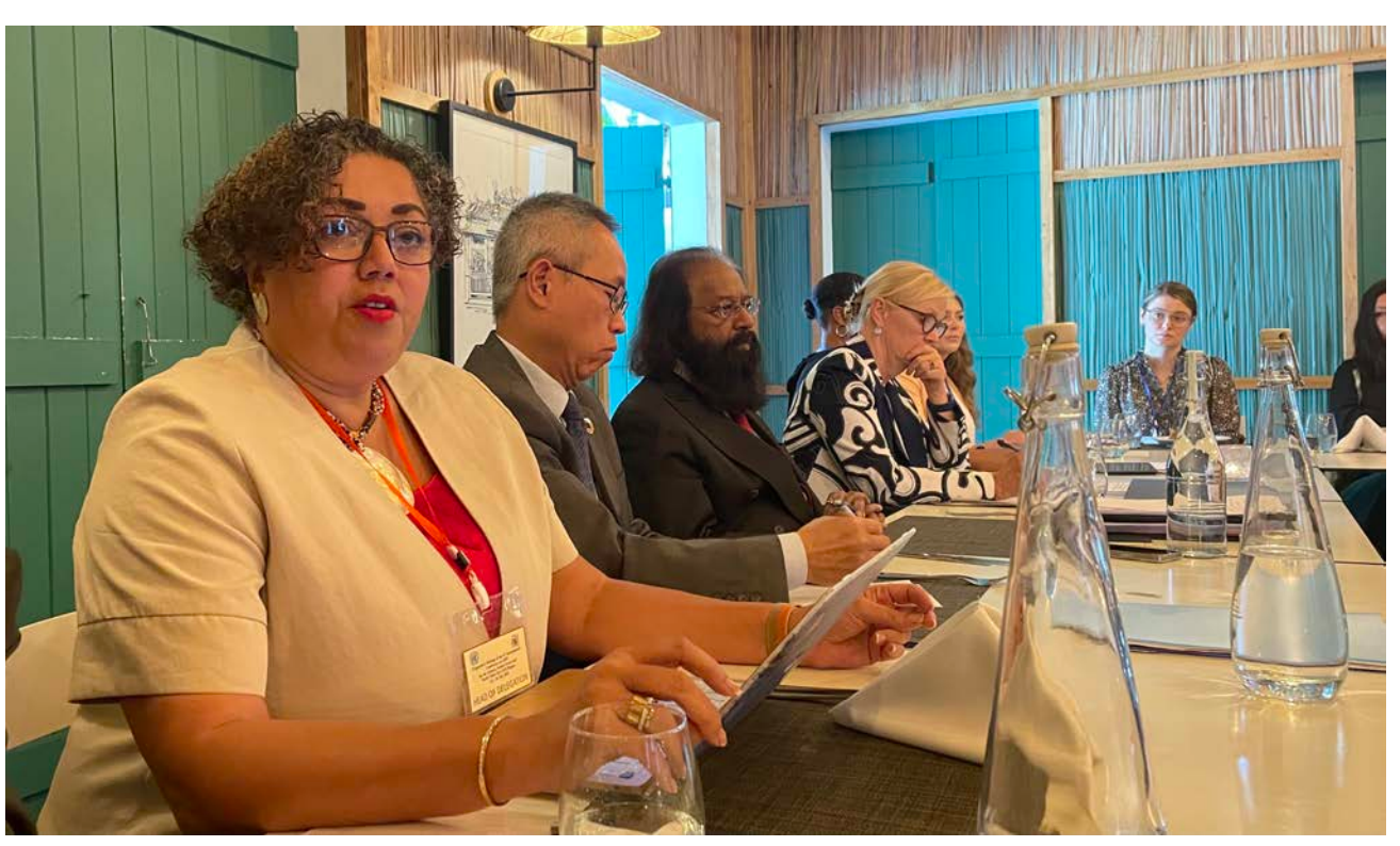
Participants at the regional meeting for islands in the Atlantic, Indian Ocean and South China Sea meet in July 2023 in Port Louis, Mauritius

Throughout the year, UN DESA helped government field visits, participants were able to receive a officials and relevant stakeholders to enhance their deep appreciation of the inclusive development capacity to implement the 2030 Agenda and the journey that Rwanda has travelled since the 1994 SDGs. For example, during August - September 2022, Genocide against the Tutsis, to becoming one of the the Department organized a peer learning workshop best performing countries implementing the 2030 for officials from the Governments of Namibia and Agenda and AU Agenda 2063. Zimbabwe on "Rwanda's experience integrating the 2030 Agenda for Sustainable Development and AU Agenda 2063 into its national development plans system's offering to countries and strategies" in Kigali, Rwanda. The workshop provided an opportunity for policymakers from To support ECOSOC in its role as an oversight Namibia and Zimbabwe to study good practices and mechanism for accelerating system-wide lessons learned in Rwanda, which can be reflected performance and results in relation to the 2030 into their own national development plans, strategies Agenda, UN DESA conducted a comprehensive set of