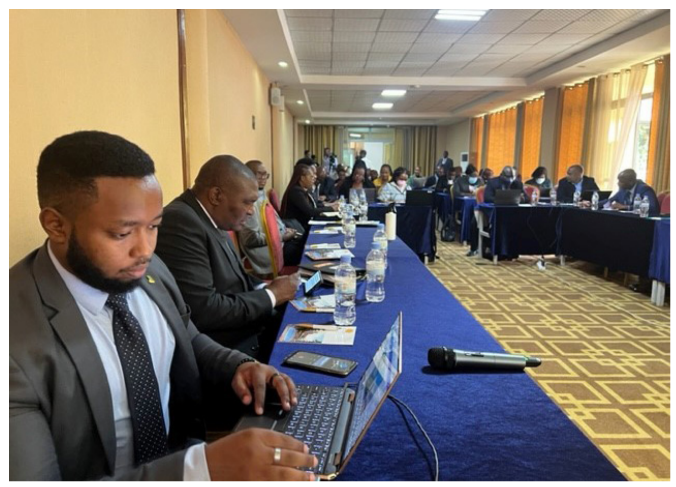
Government officials attending opening session of the peer learning workshop in Kigali, Rwanda

In 2022-2023, UN DESA continued to address the complex and multi-faceted crisis in Haiti, through its support to the ECOSOC Ad Hoc Advisory Group on Haiti (AHAGH). In June 2023, the Department supported the organization of an ECOSOC Special Meeting on the issue of food security in Haiti, which