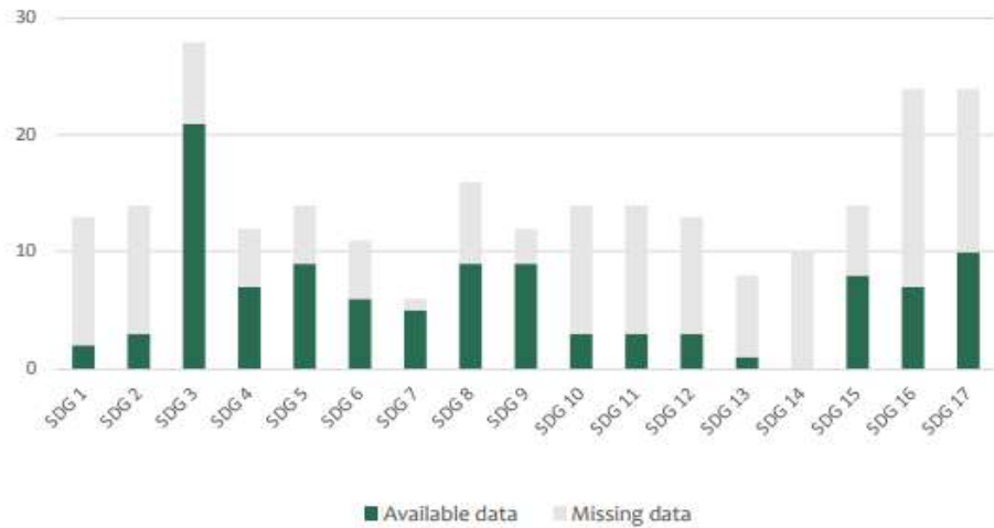
Figure: Current availability of 2030 Agenda Indicators (from the Czech Republic’s 2021 VNR Report, page 30)

Some countries provided additional information regarding the level of data availability. Uruguay, for example, provided the level of availability for both global and national indicators, on a scale of 1 to 3, for each goal as summarized in the chart below: