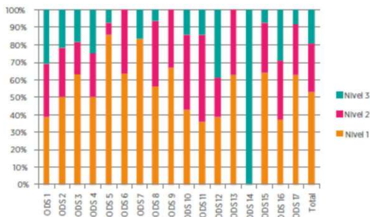
Figure: Percentage of indicators by level of data availability in Uruguay, for ODS. Year 2021 (from Uruguay’s 2021 VNR Report, page 31)

Countries also shared details on their ability to collect disaggregated data. While the majority of countries provided some level of disaggregation, the scope of indicators covered and the dimensions of disaggregation varied. For the countries that did provide some level of disaggregation, it was most often conducted by gender, region or age group, and in most cases only for a select number of indicators.