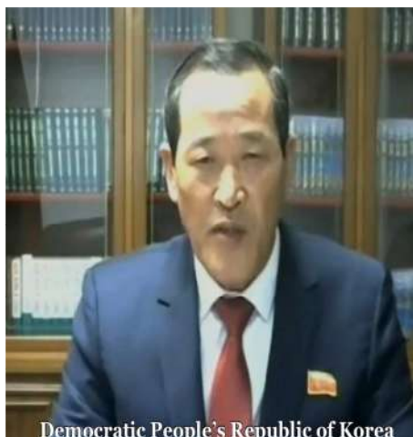
Democratic People's Republic of Korea

The Democratic People's Republic of Korea reported that it had signed the Cartagena Protocol on Biodiversity and established an institutional structure for its implementation.