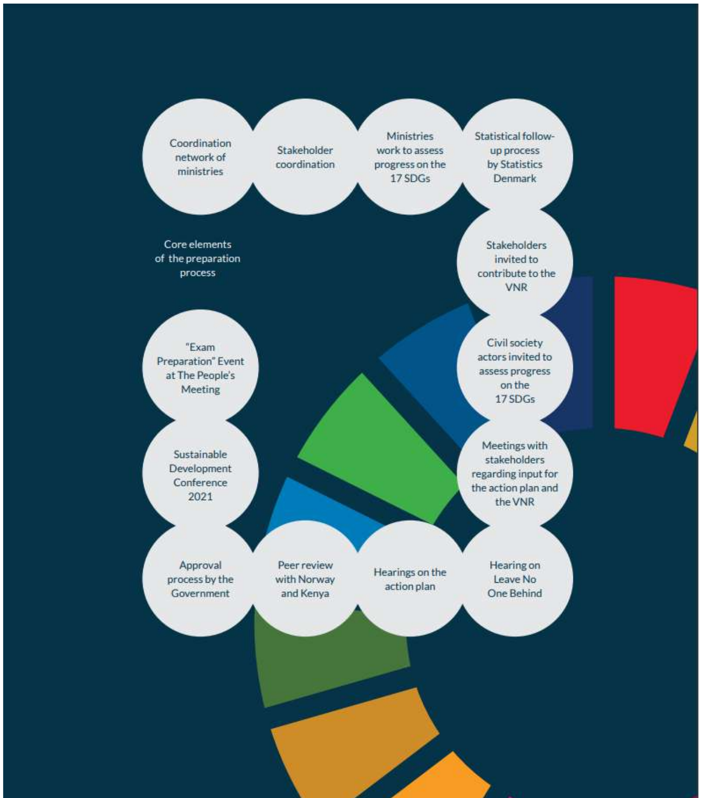
Figure 2: From Denmark's 2021 VNR Report, page 19