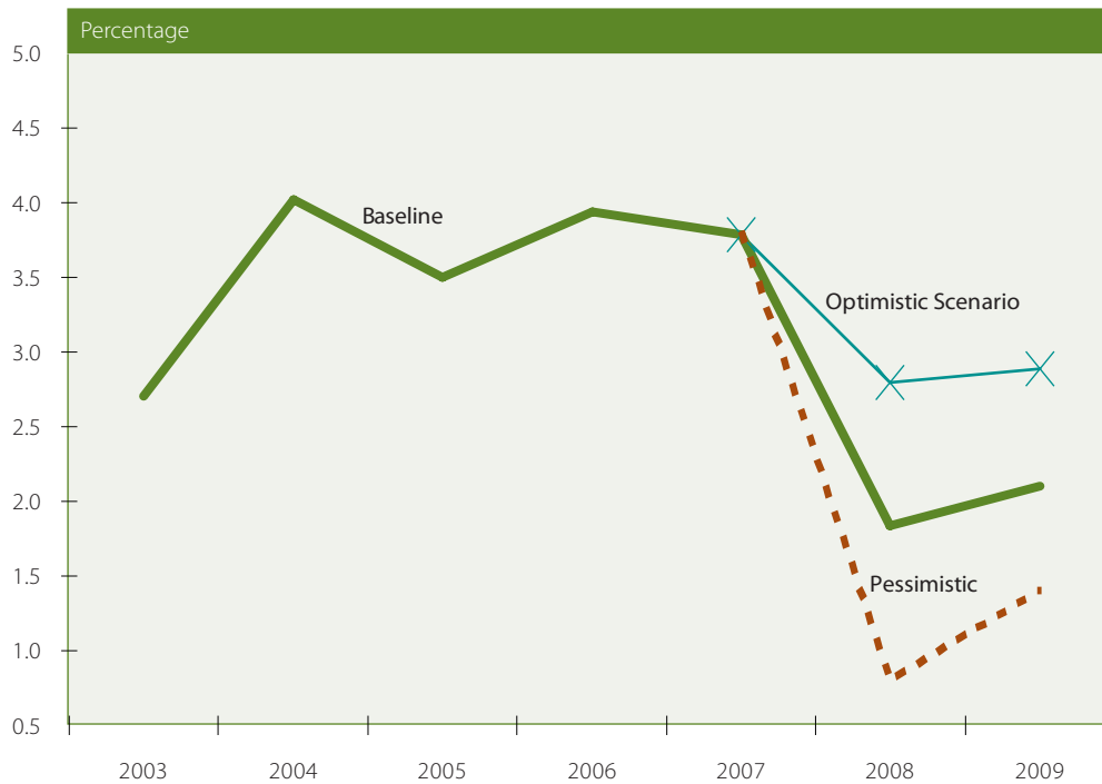
Figure 1: World economic growth under three scenarios, 2003-2009

Source: UN/DESA. See Table 1 for scenario assumptions.