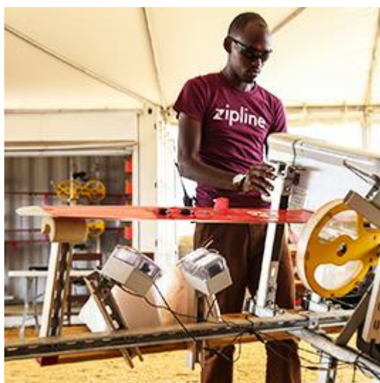
Zipline uses drone technology to save lives